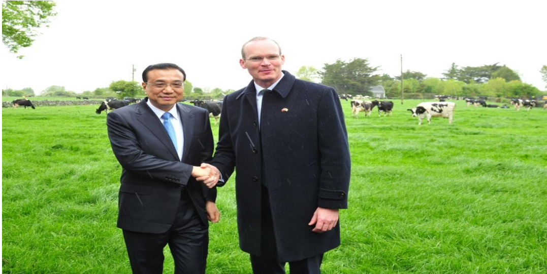
Chinese Premier Li Keqiang visiting an Irish farm with Agriculture Minister Simon Coveney (May 2015)

Agri food exports to China 2014: €650 million